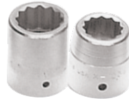
12 Drive Shallow 12-Point Socket, High Polished Chrome Finish, 2-3/16 JHWX-1272