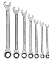
12Pt 5/8 Standard Ratcheting Combination Wrench JHW1220RS