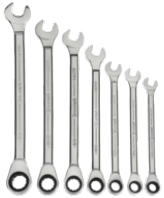
12Pt 11/32 Standard Ratcheting Combination Wrench JHW1211RS