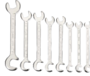
Miniature 15 Degree x 80 Degree Double Head Open End Wrench 9/32" JHW1118A