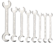
Miniature 15 Degree x 80 Degree Double Head Open End Wrench 7/32" JHW1114A